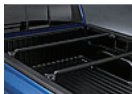
Cargo Cross Bars