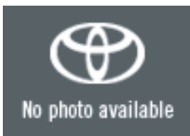
Bike Rack Attachment note: requires adapter kit