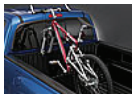
Fork Mount Bike Attachment