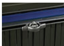
Cleat Tie Down